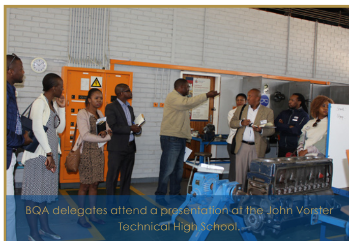
BQA delegates attend a presentation at the John Vorster Technical High School.

Umalusi is certainly living true to its vision: 'A trusted authority in quality assurance of education provision, recognised locally and internationally.'