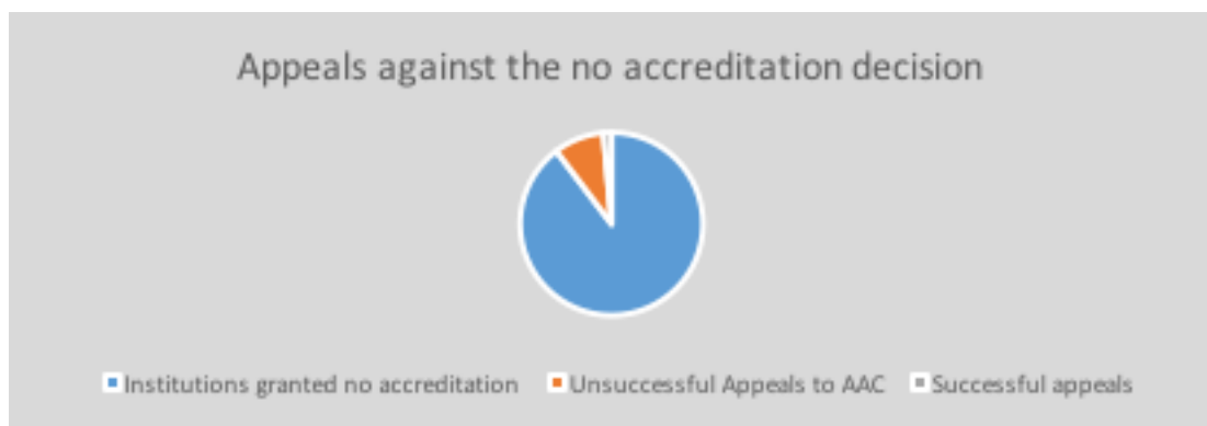
Figure 2: Appeals against no accreditation decisions from 1 April 2019 to 31 December 2021

decision. Overall, this represents 1.5% of no accreditation decisions of the ACC made between 1 April 2019 and 31 December 2021, which have been reviewed by the AAC. The appeals were successful based on procedural matters rather than an incorrect decision being made at the time of the evaluation. This is evidence of the rigorous and reliable processes in place in considering the outcome of applications for accreditation.